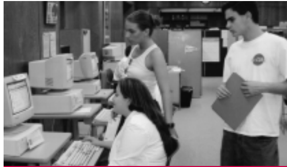
Students reviewing potential colleges at the Higher Education Information Center in Boston

agencies, organizations, and associations, as well as colleges, businesses, corporations, and the federal government. The centers' impact is widespread, based on