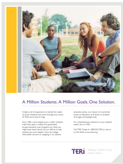
New TERI ad campaign launched Spring 2004

Current LIBOR: 1.51% (as of 10/1/04). Current Prime: 4.00% (as of 7/1/04)