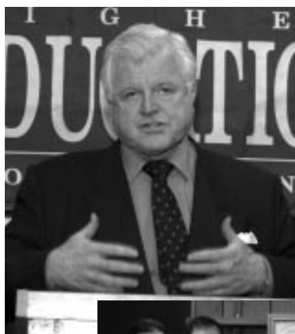
Senator Edward M. Kennedy speaks at new EOC.

TERI's Higher Education Information Center (HEIC) recently was awarded two federal grants in support of its ongoing efforts in Brockton, MA to provide college access services for students and adults of under-represented and low income families. The Upward Bound Program, sponsored by HEIC and in collaboration with Stonehill College and Brockton High School, helps approximately 50 young students per year to prepare for college by offering instruction in math, science, literature and composition. In addition to engaging in these courses, during summer sessions students live in Stonehill dormitories for six-week periods of time, in doing so gaining a better sense of the college atmosphere. HEIC is also running the Education Opportunity Center (EOC) of Brockton, which assists underemployed individuals ages 18-64 by helping them choose education opportunities that will help better position themselves in the job market, as well finding suitable financial aide. Both programs are funded through the U.S. Department of Education with support from TERI.